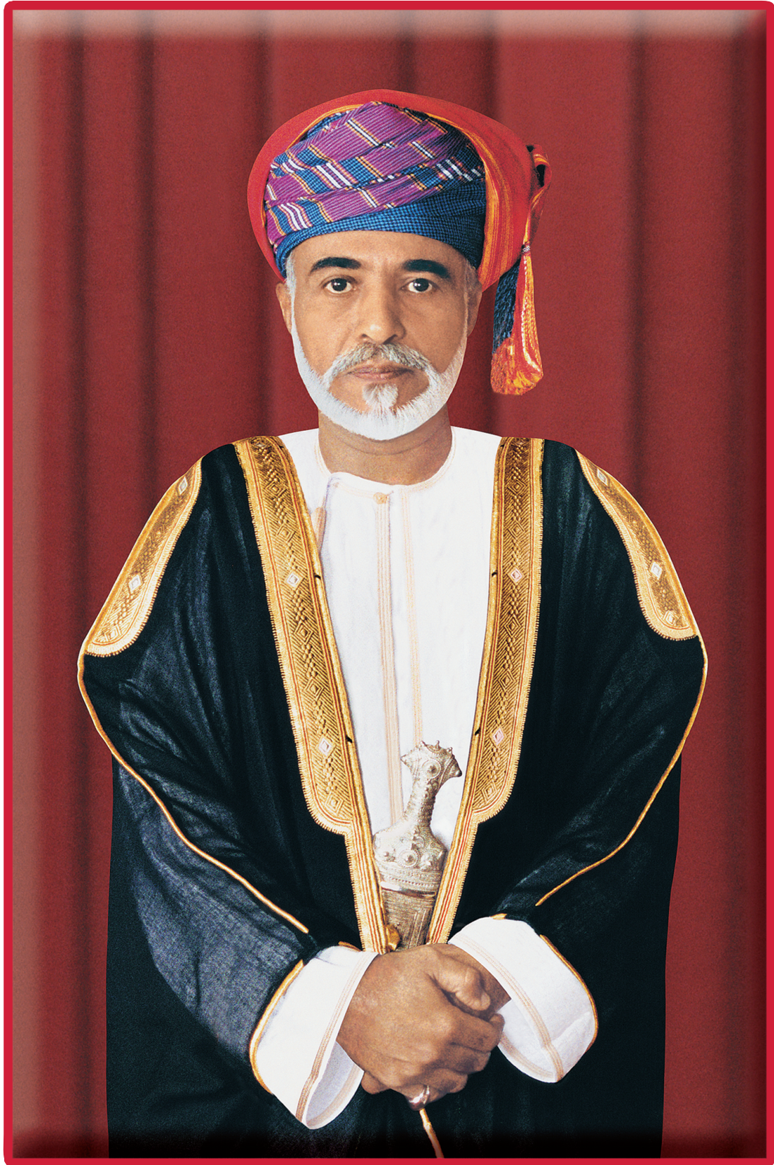
His Majesty Sultan Qaboos bin Said, Sultan of Oman